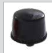
b. Rubber Head