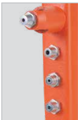
4 nose pieces for a range of rivets sizes: 3/32" (2.4 mm) 1/8" (3.2 mm) 5/32" (4.0 mm) 3/16" (4.8 mm)