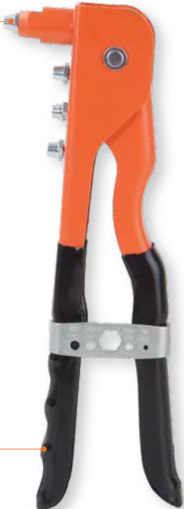
Longer handle with ergonomic PVC dip coated sleeve