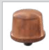
c. Brass Head