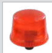
a. Plastic Head