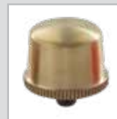
d. Copper Head