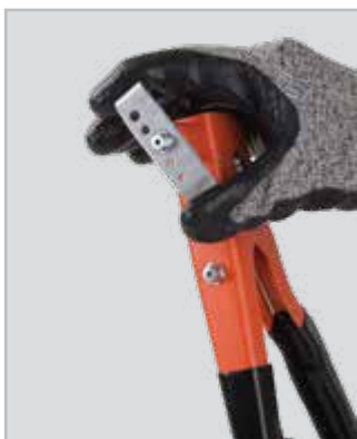
Convenient change of nose pieces with wrench