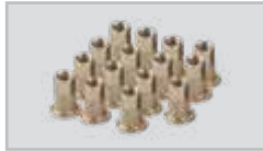
M4 Rivets: 15