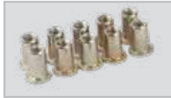
M6 Rivets: 10