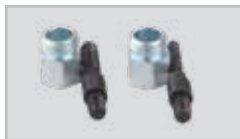
Threaded Mandrels & Nose pieces