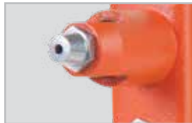
Nose body designed to fit into smaller applications

Suitable for industrial, engineering & maintenance jobs