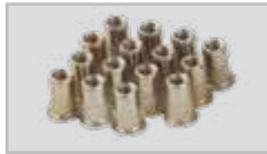
M5 Rivets: 15